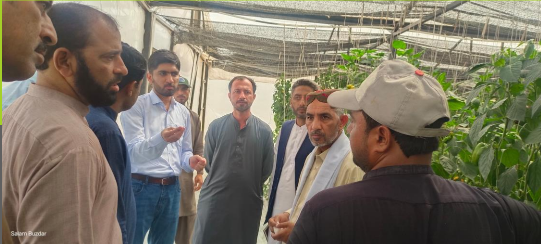
Visit to Multan University