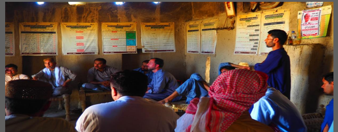
Shed for farmers