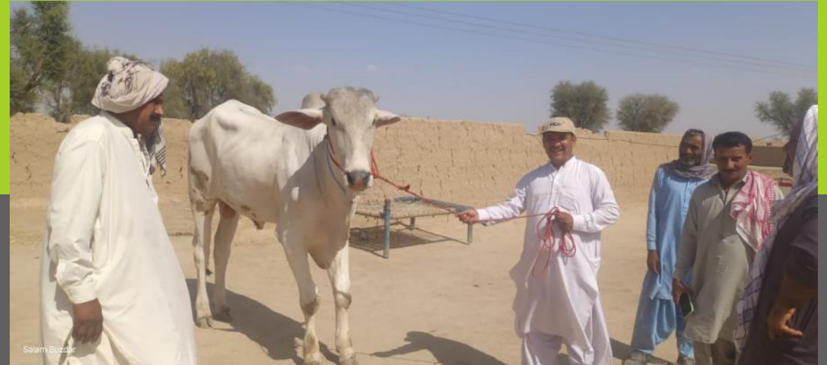
Livestock from Bhag