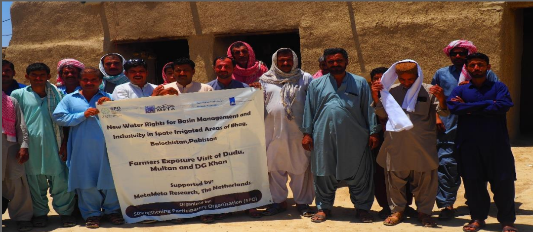
Group picture in Dadu