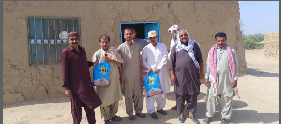
Sharing of seeds