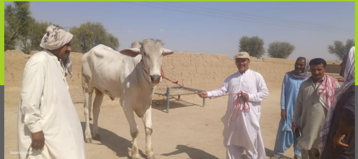
Livestock from Bhag