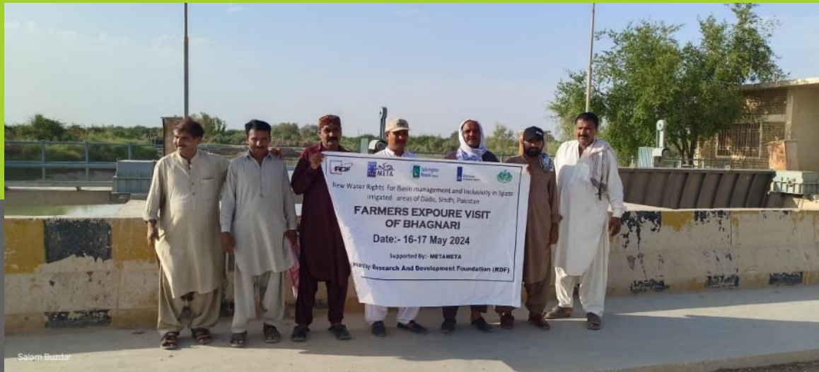
Visit to Ghazi Dam