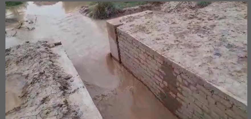
Field inlet during construction and in use