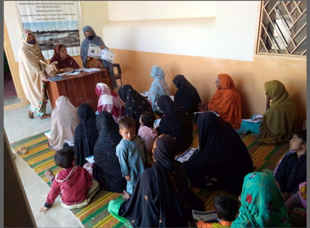
Health and Hygiene training, held at the Social Welfare Centre