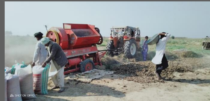
Harvest of sorghum