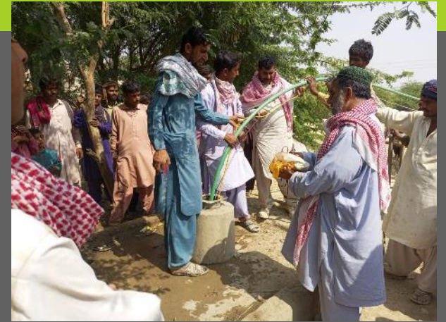
Installation of borehole