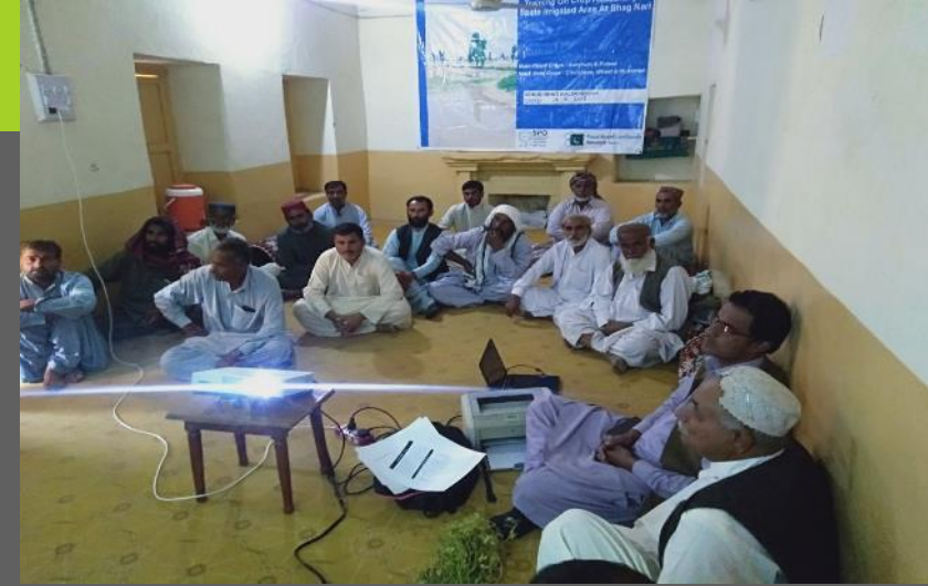
Training with farmer group