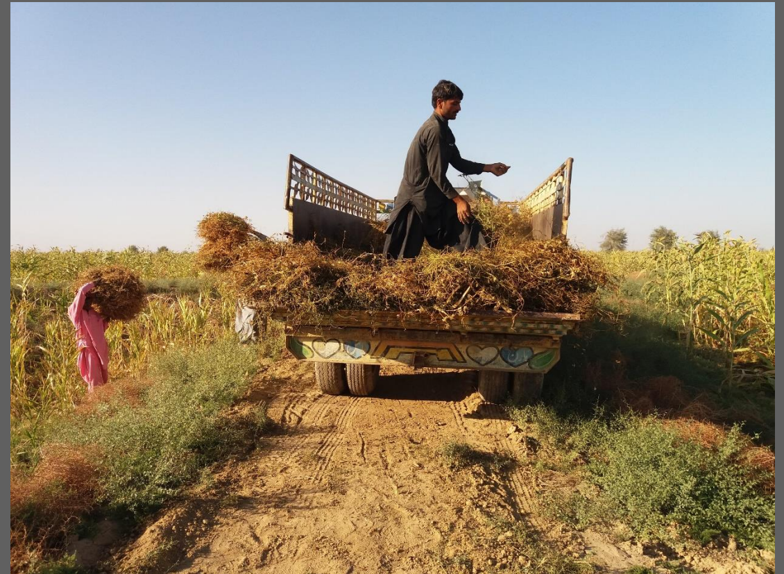
Harvest of Mooth Beans from an intercropped field with sorghum