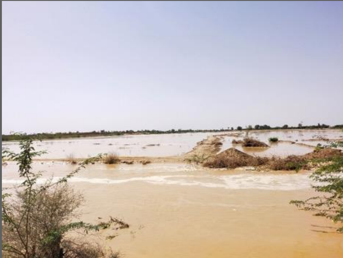
Irrigation of fields with flood water