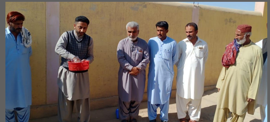
Training on use of inauculant