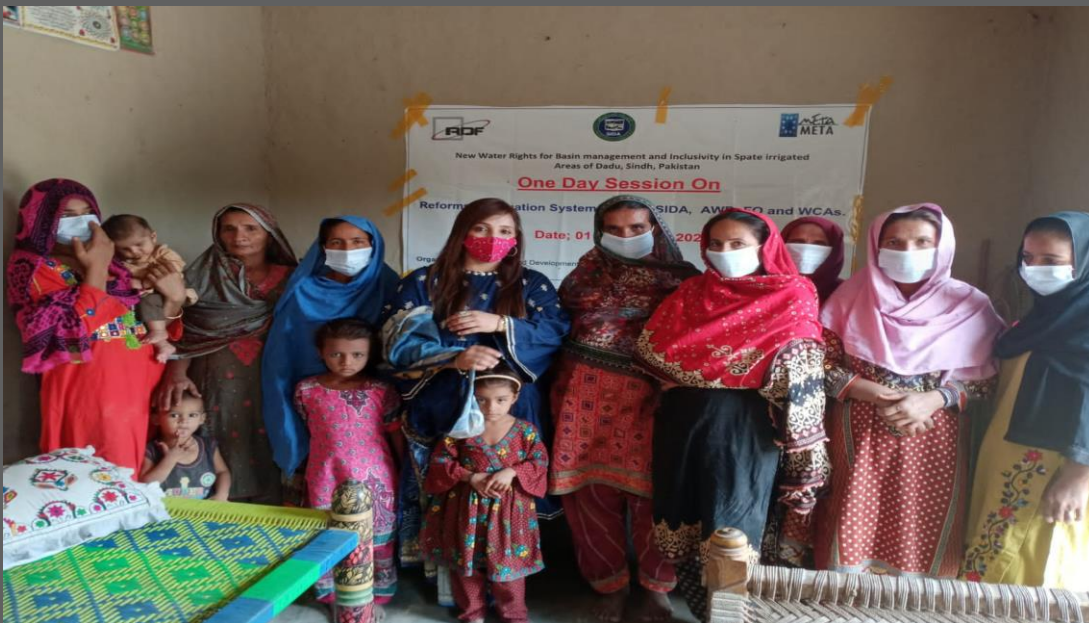
Meetings with Female Farmers, with SIDA