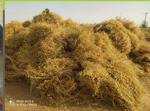
Harvest of Chick Pea trials