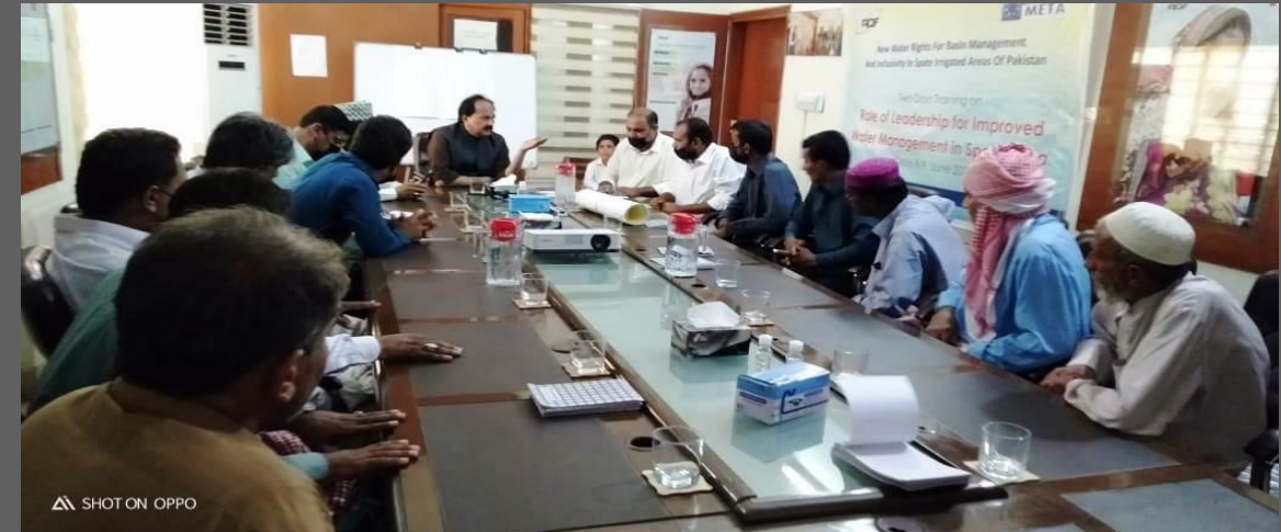
Water Management training