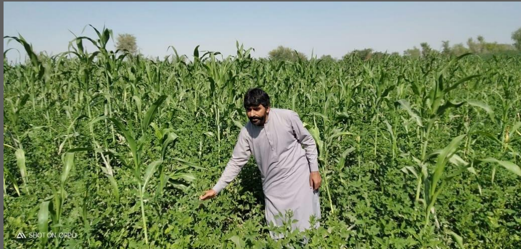
Newly cultivated area, Bahawal Jo Gandho