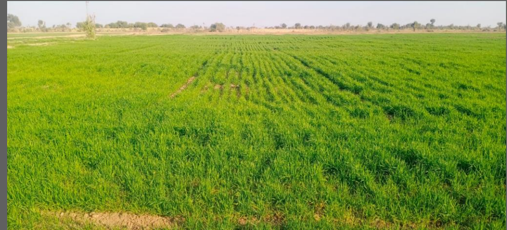
Organic Wheat, Bhag Narri