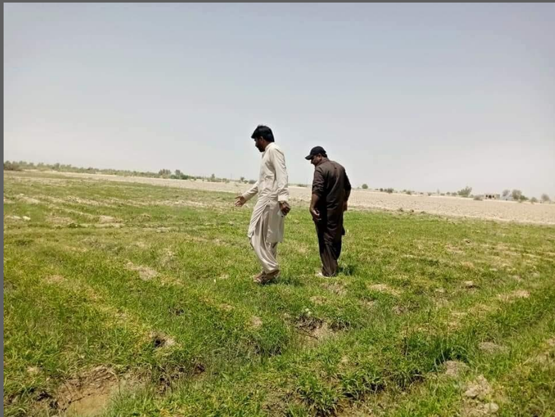
Broadcasting method of planting