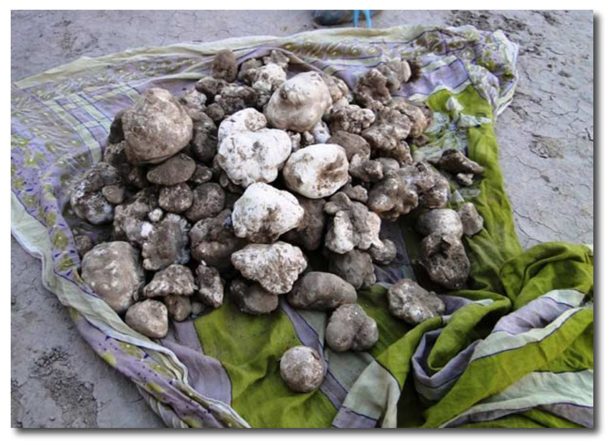
Figure 2 Truffles collected from sorghum field.

Usually truffles growing in open fields or other similar sites are considered nature's aifts and landowners do not have any objection to making their land freely accessible to allow people to collect these delicacies. However, formal permission is required for non owners to collect truffles within a sown field. Sometimes truffles are dried by simply slicing them and sun-drying them in an open space. Mushrooms with solid fibre structures are preferred for this process. The prices are Rs.150/Kg (US 2/Kg) for common mushrooms (above ground). The prices for special wild mushrooms are considerably higher. For example the special wild mushroom for Swat region commonly known as Guchhai (morel) are sold in Rs. 10,000-Rs. 20,000 (125-250 US$) per kilogram. The prices for desert truffles are even higher than this.