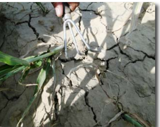
Figure 4 Close View of Truffle site where soil has cracks and bit lifted upwards.