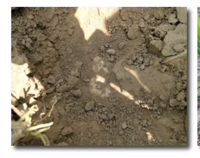
Figure 5 Digging site confirms the appearance of Truffle - Showing the size and number.