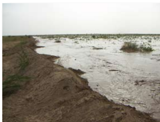
Figure 17 guiding water across huge fields with small field bunds, Gash, Sudan.

The Tokar Delta is the outwash fan of the Baraka River (Barka in Eritrea) on the coastal plain of the Red Sea some 150 km south/south-east of the Red Sea state capital Port Sudan. The Delta covers a gross area of about 406,000 feddans (170,520 ha) of which about 40% (160,000 feddans) has been irrigated in the past. The Delta is divided into three parts, the Western, Middle and Eastern Delta areas with the central area forming the main part of the irrigation scheme. The town of Tokar is located about 35 km from