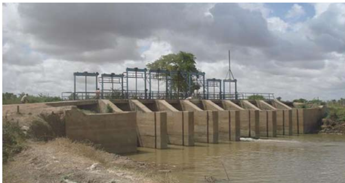
Figure 25 Improvement in Flood Irrigation System, Shabelle, Somalia.

Spate irrigation, however, is 'different'. This shows from the description of some of the systems, for instance the fine and delicate balance of managing the Gash and Tokar systems in Sudan and the need for good overall management and cohesive and effective farmer involvement. Engineering designs are dominated in most cases by the civil engineering approach to conventional perennial irrigation. There are few design manuals to guide engineers and most approaches reflect the relatively limited attention paid to ensuring that technical aspects are correctly approached. With the relatively poor