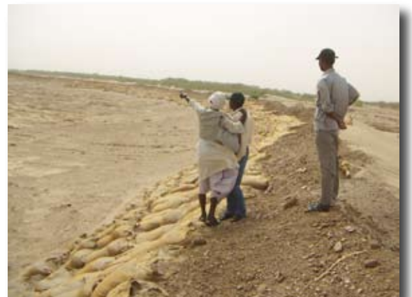
Figure 22 Tomosay Bund reinforced with sand bags, Tokar, Sudan.