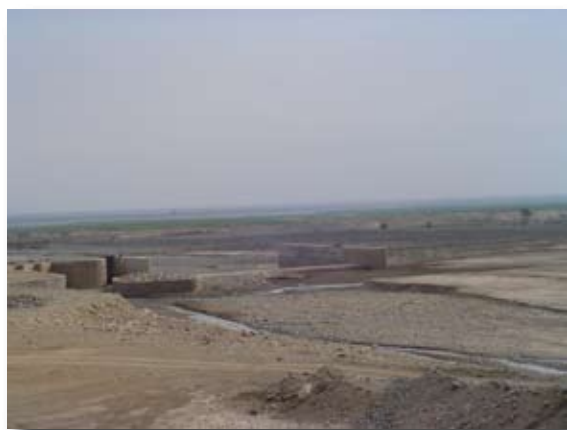
Figure 9 Modernized headworks at Wadi Laba: weir, intake gate, sluice gate, sedimentation pond (not visible) and breaching bund, She'eb, Eritrea.

This came to a head 2002, the first year of full operation, when floods in excess of a one in 250 return period occurred in both catchments causing substantial damage to river training works on both state irrigation schemes. The analysis indicated that at Wadi Laba the breaching bund broke too late and that at Wadi Mai Ule, the downstream change of Wadi course that was part of the improvement works was too rapid ( \sim 90^\circ ), to place too close to the Wadi gorge and that the capacity of the new Wadi channel insufficient and inconsistent therefore causing a throttling effect at large flows and creating a backwater that over topped the guide banks causing the flood flows to pass through the irrigation scheme. It was concluded that the construction of such