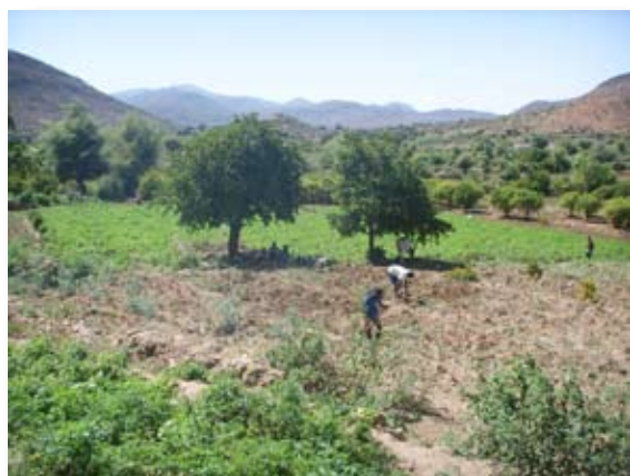
Figure 3 Supplementary irrigation from spate, Belilo (East Harrarghe), Ethiopia.

Also the Yandefero system in Konso (SNNPR) consist of a multitude of short flood intakes. At present there are 29 flood intakes - made of soil and brushwood. The entire area that can in principle be irrigated is close to 4000 ha. Eleven of the flood intakes date back thirty years or more. Most of the remaining ones were developed in the last few years under various food for work arrangements. Recently, the Yanda river has started to degrade dramatically - going down one to two meter over large stretches. This degradation most likely was caused by the cutting of a stretch of downstream riverain forest which caused the Yanda river to shift its outlet to a lower section. The degrading of the river bed has forced farmers to extend the flood channels higher up in the river bed - sometime curving around bends. This has left the intake structures more exposed to the force of floods, and several of them are no longer used. The remaining intakes sustain a mixed cropping system of small-holder maize, sorghum and cotton. Farmers do not reside in the lowland area for fear of malaria and