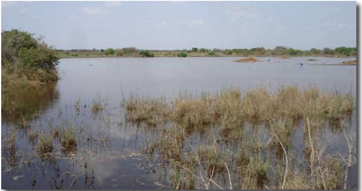
Figure 24 Flooded fields, Shabelle, Somalia.

area under deshek is in the pre-disturbance period was estimated between 110,000 to 150,000 ha (Basynat and Gadain 2009). The specific component under spate irrigation is not clear but is probably not the larger part.