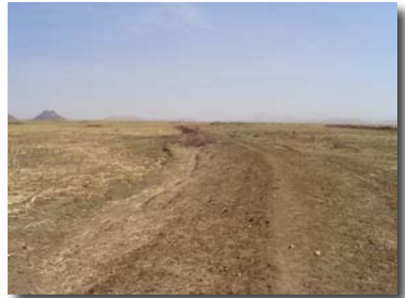
Figure 13 Guide bund to spread water over command area, Alebu (Gash Barka), Eritrea.

The high crop yields of the Eastern Lowlands are not attained in the Western Lowlands, Although sorghum is not the principal crop in these areas, there is considerably potential to increase the average rainfed sorghum yield from the current level of 450 kg/ha to the much higher yields indicated from crop cuttings by the Ministry of Agriculture (1200-2100 kg/ha). This maybe compared to yields of 3,000-4,000 kg/ha in the Eastern Lowlands. Ratooning is not common in the Western Lowlands. Short maturing (60-70 days)