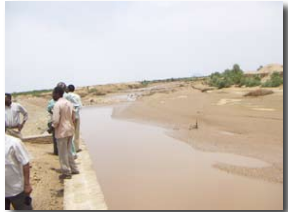
Figure 18 Gash, flood yet to reach Umbareisi-Metateib intake, Gash, Sudan.

Local dune and sand ridge formation is a major challenge in Tokar. With the numerous and forceful erosive winds that blow across the Tokar scheme, all stalks from the sorghum and other crops need to be removed after harvesting in order to provide no restriction to the wind that can and will transport much soil. In the past, regulations existed to ensure that all farmers complied with this or were fined for failing to carry out the work. Repeated offenders were expelled from the scheme as their lack of diligence impacted on all farmers. When sorghum stalks are not removed (as has been happening over large parts of the scheme), small mounds up to 0.60 metres in height develop and this significantly hinder the movement of sheet flow and hence the irrigation of the land. Small gullies and channels are formed and water distribution is extremely uneven. In the past, clearing of the