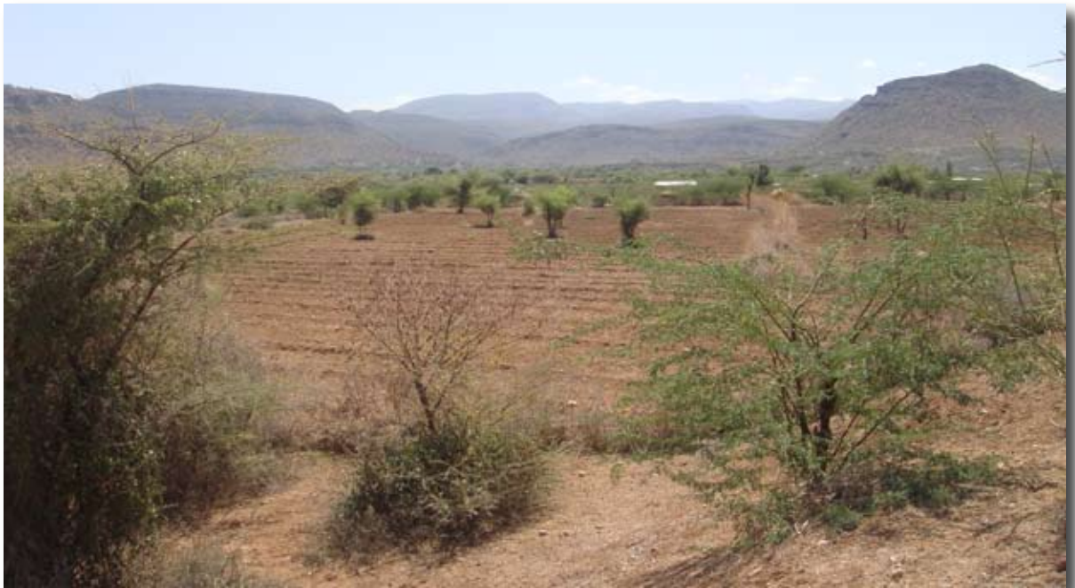
Figure 1 Newly developed spate irrigation system in east harrarghe, Ethiopia.

Spate irrigation differs from other flood-based farming system in that it diverts flood flows from ephemeral streams to enter the irrigation network. The short duration floods on which spate water management is based are often forceful in nature, requiring special techniques and special organizations to manage and distribute the water. Spate irrigation is different for instance from flood recession farming, where the moisture left behind after river flood plains or lake plain are flooded is used 2 . Spate irrigation is also different from inundation canals – where canals flow when water levels in a river reach a certain level. Spate irrigation also differs from semi-perennial irrigation, that uses flows that run for a number of months only 3 . The main difference however