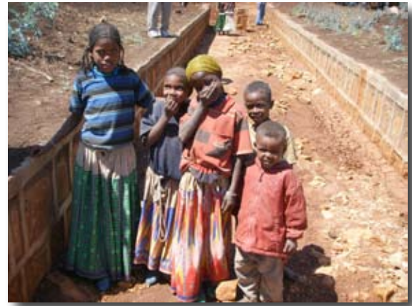
Figure 4 Improved small spate irrigation system, Ija Galma Wago (East Harrarghe), Ethiopia.

Until ten years ago much of the external investment in improved spate irrigation systems was done by non-government organizations, but in recent years Water Resources Bureaus in several regions have taken over and sometimes invested substantially in spate irrigation development. The front runner is Oromia State. In Oromia Regional State there are 30 projects at reconnaissance stage, 58 projects under study and design and 38 spate irrigation projects under construction (Alemehayu 2008). The investment program started in 1998 in East and West Hararge Zone, with first systems such as Ija Galma Waqo (Fedis, East Hararge); Ija Malabe (Fedis, East Hararge). Bililo (Mi'eso, West Hararge) and Hargetii (Mi'eso, West Hararge). These systems concern both semi-perennial and spate irrigation systems. One of the largest systems is Dodota, situated in a rain-shadow area in Arsi. Dodota takes its water from the semi-perennial Boru river (van den Ham 2008). The stream has no other off-takes upstream along and is not used by other upstream or downstream users. The total net potential area for spate irrigation was estimated to be approximately 5000ha. The main objective of the design was to supplement the rainfall in the area. Based on the requirements, permanent diversion structures were made with concrete and masonry. A striking feature of the design process