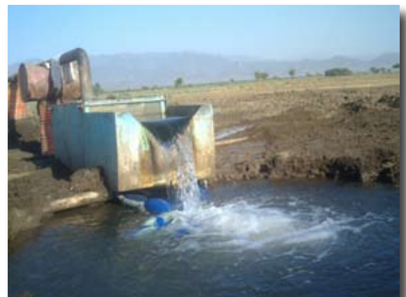
Figure 2 Groundwater Exploration, Raja Valley, Ethiopia.

According to various recent estimates, traditional