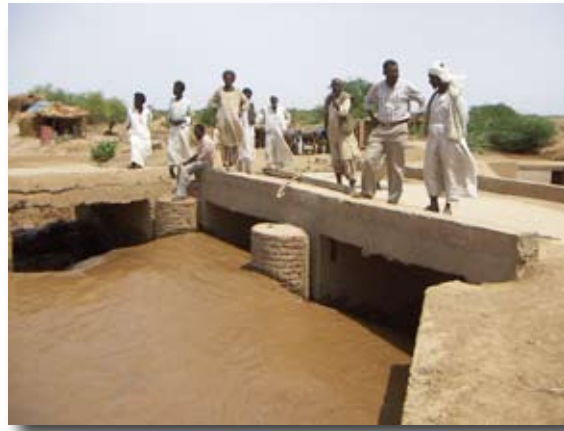
Figure 15 Flow divider at Makala channel, Gash, Sudan.

Misga offtakes are “paired” throughout the Gash system to maintain flows within the capacity of the canal systems and to ensure better equality of land for farmers. This means that in any one year only a maximum of 50% (or 120,000 feddans ) of the total command area is irrigated. This is called the target area for irrigation. The difference between area irrigated and actually cultivated indicates the level of water management both at misga level and at scheme level in terms of delivery of water to the misgas . In recent years, some blocks ( mekali ) have achieved high ratios (>90%) but there is still considerable scope for improved water management on all blocks. Under the GSLRP modernisation of the system, the crop rotation was reduced from 3 to 2 years to increase the area of land under cultivation per year and to benefit a greater number of farmers. Although there are disadvantages in the 2-year rotation relating to weed growth and mesquite development, these are outweighed by being able to accommodate many more farmers than was possible under the past 3-year rotation.