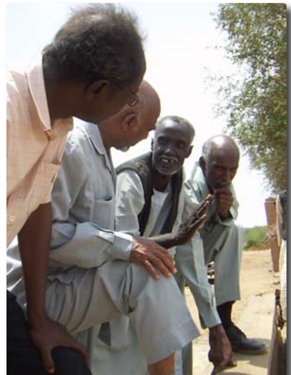
Figure 16 Gate operators explaining flood level at Hashera, Gash, Sudan.

However, due to the intense population pressure and slow land reform, the increase is not yet sufficient to sustain food security and to generate surplus cash. Moreover, predicted returns from water charges for the recovery under the traditional sorghum based farming systems but with improved varieties being increasingly grown