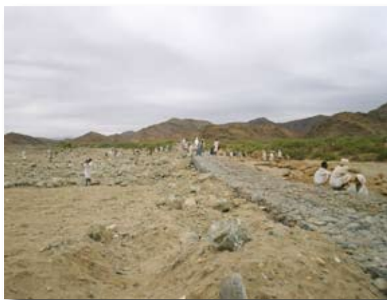
Figure 10 River engineering approach at work: deflectors and protection bund improved with gabions and earthwork, Wadi Labka, Eritrea.