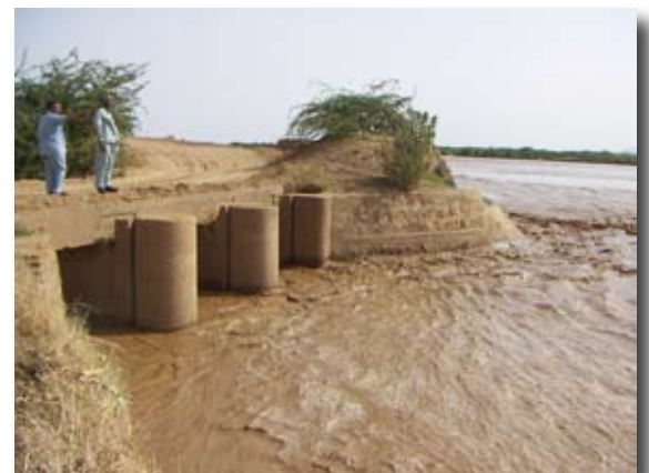
Figure 14 Fota Intake: silt-laden floodwater, Gash, Sudan.

Floods in the Gash River usually come in a number of "flushes" that are divided into early and late flushes. The early flush which is denoted as the first rotation or watering takes place around the last week in June and ends towards mid-August. The late flush, or second rotation, extends from about mid-August to mid-September. Between the flushes, intervals occur but water levels in