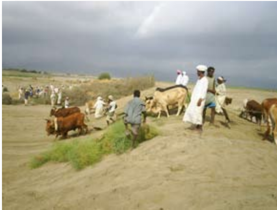
Figure 8 Traditional maintenance of diversion and guide bunds, She'eb, Eritrea.

The major crop in She'eb is sorghum. When floods are late or erratic, maize and pearl millet are grown. The most popular sorghum variety used to