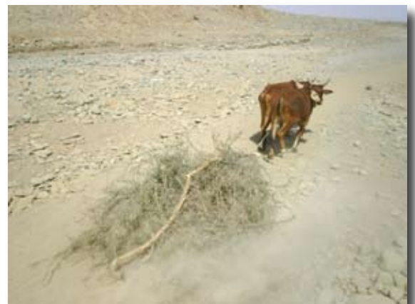
Figure 7 Acacia brushwood used for diversion and guide bunds: source of deforestation, She'eb, Eritrea.

Most partas have more than one leader but one is usually a primus inter pares . This ternafi is expected to assess labour requirements for common works and convey information and