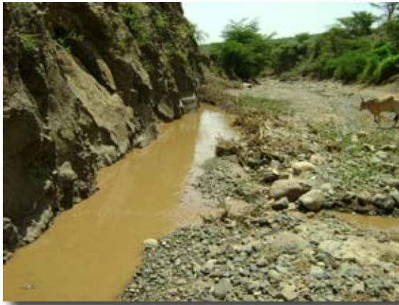
Figure 5 Capturing the recession flow, Weltane (West Harrarge), Ethiopia.

typically very high maintenance burden - were in several instances replaced with stone masonry walls that were supposed to relieve farmers of these time-consuming tasks. These walls were not able to stand up to the floods and in several cases were toppled over. Along the Murga river this also led for instance on the Murga river, to the abandoning of previously cultivated land.