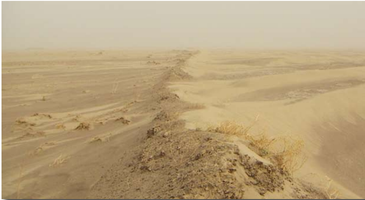
Figure 23 Guide bund to spread floods: very difficult as sand dunes and sand deposition create many obstacles, Tokar, Sudan.