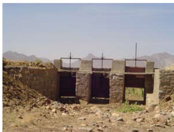
Figure 12 Intakes and sluice gate to improved small system, Alebu (Gash Barka), Eritrea.

The experience in modernizing Wadi Laba and Mai Ule needs to be compared with the very different approach to the improvement works