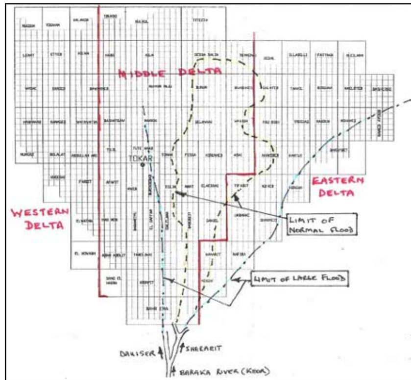
Figure 19 Topography of Tokar Delta.

flow. A main feature in Tokar is the Tomosay diversion bund and the Tomosay Embankment, which begins on the left (western) bank of the Baraka river and extends for about 50 km along the Western limit of the scheme and then turns eastward to provide a limit on the North side and restrict outflows to the sea. There are also guide banks on the Eastern Side of the irrigated area. The embankment has been built to act as a guide to flood flows to contain them within the Middle Delta, the most suitable land for irrigation, and to limit the spread of the annual floods to the better lands and thereby ensure that adequate depths of irrigation are provided within the irrigated