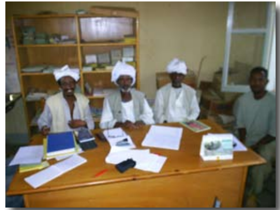
Figure 11 She'eb Farmers Association, collecting equivalent of USD 40/ hectare for maintenance - among others, Eritrea.

These seasons made it possible to review the