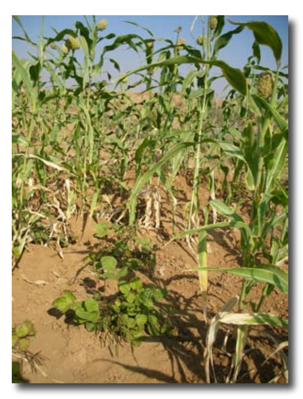
Figure 7. Multi crop Spate irrigation field with moong beans and sorghum

International experience is that modernization only works in certain cases and that in other cases improving traditional systems is more effective and economical both in investment and O&M cost. The cost of such improved traditional systems typically is in the range of USD 20-180/ha and concerns a range of interventions: using bed stabilizers, flow dividers and reinforcement of traditional earthen structures for instance. In Pakistan in most provinces a bulldozer programme has been in operation – providing earthmoving