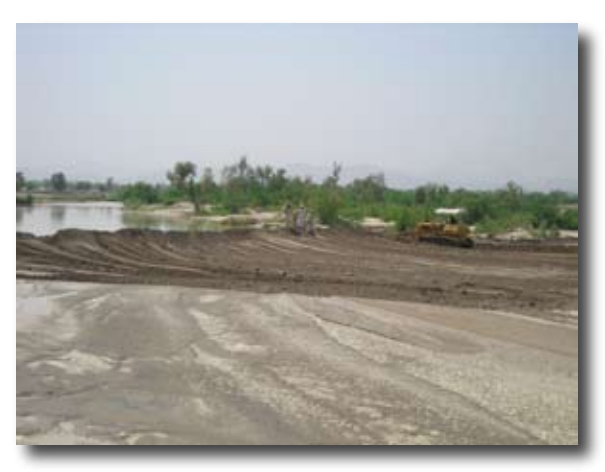
Figure 6. Bulldozer programme at work in Danghar Wali

risk remain high in modernization projects, if only because of the challenges of managing sedimentation, dealing with occasional high floods and capturing shifting low flow canals.