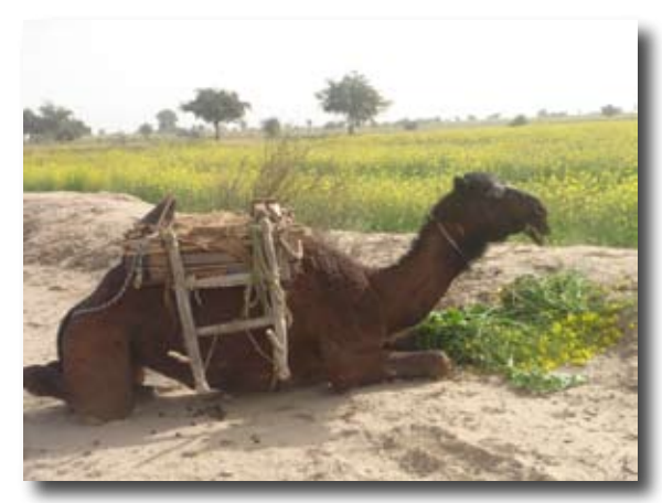
Figure 3. Spate irrigation: high potential for oilseeds and pulses

between the timing of watering and seeding. Another special feature of spate irrigation is the management of sediment. As sediment loads of spate flows may be as high as 10%, spate irrigation is as much about managing water and it is about managing sedimentation.