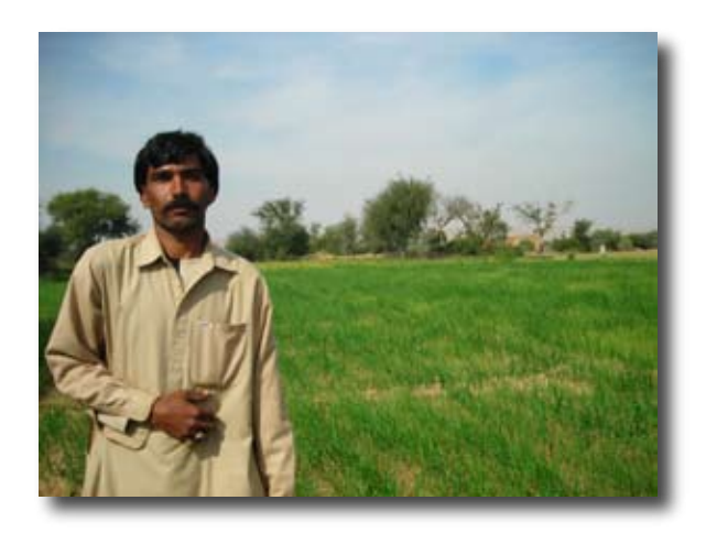
Figure 8. Improving productivity. Spate irrigated onion fields

Spate irrigation can address some of the major food security countries that Pakistan is facing and help regenerate livelihoods in areas where the poor-of-the-poorest are living. What is required is a concerted strategy and investment plan, making use of the different opportunities described above for extensification and intensification. Such a strategy should put farmer initiative and management centre stage, building on a long history of spate irrigation management by farmers and local government. As spate irrigation develops new and reinvigorated institutional arrangements are required and a protection of the rights of all riparians – building on existing and well-established traditions.