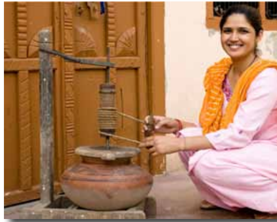
Figure 3: Traditional Wooden Milk Churner, India

Indian electric churner having vertical blades. This model is popular in some parts of India. Vertical blades ensure maximum mixing and rotation of yogurt, are made of steel, easy to clean and don't smell. The length of shaft can be adjusted through lid based adjusters. Blades and shaft can be detached. Spare parts are easily available and repair is economical.