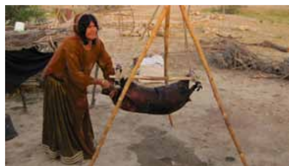
Figure 1 Milk Churning (Yogurt Churning) in Animal Skin (Goat/Sheep/Yak) in Central Asia

In the Subcontinent the traditional churning utensil used are often made of clay, stainless steel and aluminum. In rural areas majority people use clay jars that are manufactured specifically for this purpose by local potters. The clay jar is designed in a way that its bottom part is wide and upper part is narrow. This helps in churning the ensure moving the yogurt in liquid form does not spill. A more traditional churner device (Madhani) consists of wooden shaft a maximum one meter length and manufactured by local carpenters. Blades are attached at the bottom end and upper side