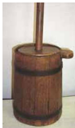
Wooden traditional milk churner – European old model