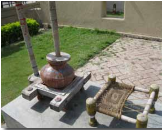
Figure 2 Traditional Wooden Milk Churner, Pakistan

has provision to attach belts to rotate the shaft forward and backward by hand. The curd jar is placed on wooden workstation and having vertical shaft parallel to churner shaft and both are connected by another belt for stability. Yogurt is churned by adding appropriate quantity of water. This locally made simple churning device is highly time consuming. It takes at least one hour to churn one liter or kilo of yogurt through this method.