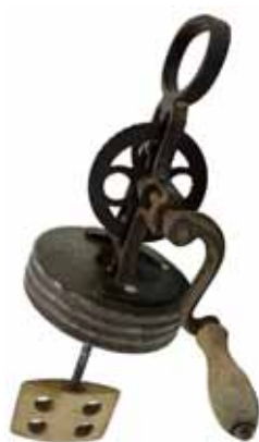
Milk churner having single blade but holes into it – European old model